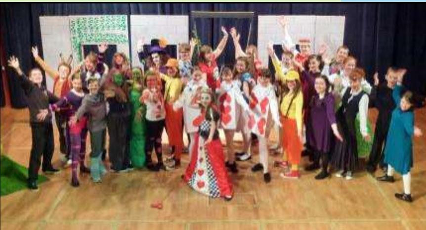
Pictured above: The cast and crew of Uist Youth Theatre warming up before their performance.