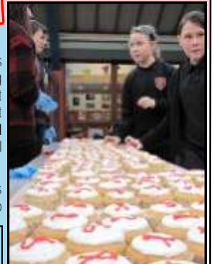
Pictured right: S1 girls being offered cake by S6 volunteers.

World AIDS Day raises awareness in young people of this condition and helps to empower them to make informed choices to protect themselves.