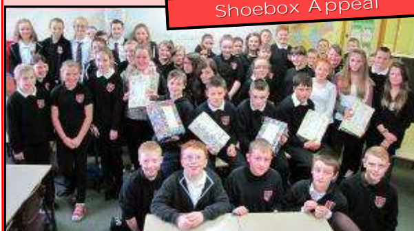
Pictured above: S1 R.E. classes with their shoeboxes neatly wrapped and full of useful items.

Air an 3mh latha den t-Samhain, thàinig ceithir de na clasaichean air a'chiad bhliadhna còmhla airson bogsaichean a lionadh do Bhlythswood. Thug sinn uile rudan beaga a-steach dhan sgoil airson na bogsaichean a lionadh: bonaidean, scarfaichean, bruisean fhiaclan, stuth sgrìobhaidh agus rudan mar sin. Lion sinn na bogsaichean le rudan snog agus phaisg sinn iad ann am paipear brèagha. Tha iad a-nis air an rathad gu clann a tha a'fuireach ann an dùthchannan bochda air feadh an t-saoghail.