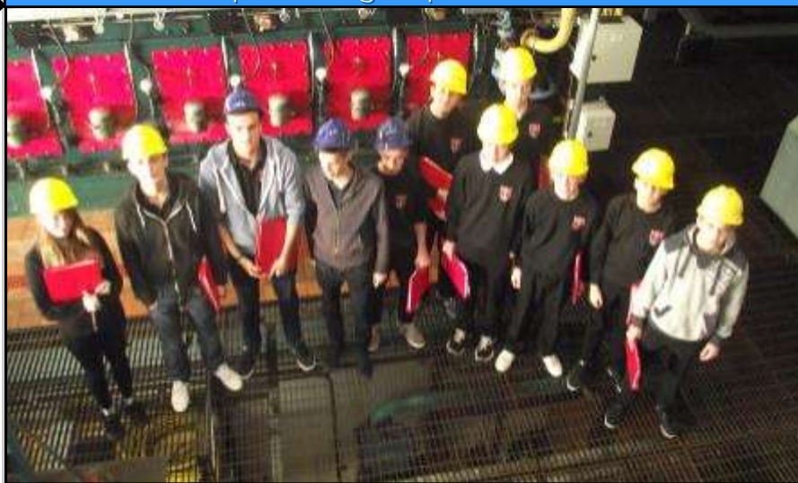
Pictured above: Skills for Work pupils during their visit to Loch Carnan Power Station.

Two groups of pupils went out to visit the Loch Carnan Power Station recently as part of the Skills for Work courses. Both the Energy and Engineering Skills for Work classes were given a presentation detailing the history of the power station and the facts and figures behind the day-to-day operations that help keep our lights on in our challenging climate. Pupils were shown around the power station and found out how the station supplies energy to the islands.