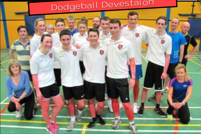
Pictured above: The S6 Dodgeball elite with their worthy teacher opponents.