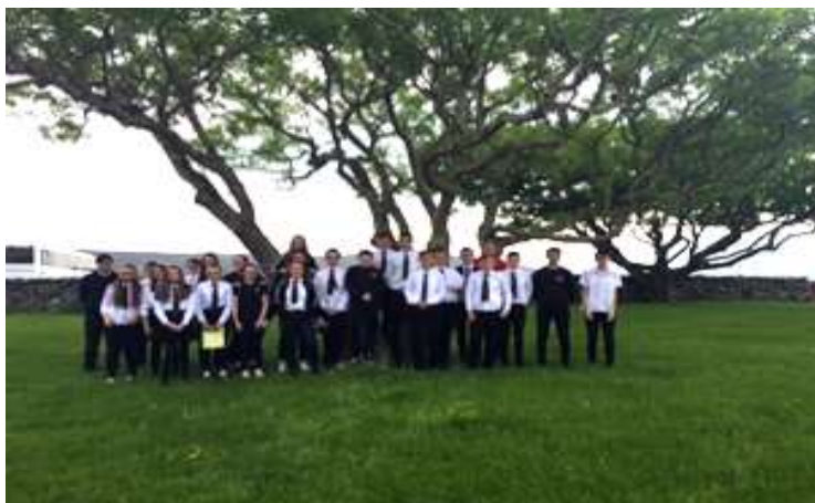
Pupils taking part Dragons Den Day

Sgoil Lionacleit would like to thank Stòras Uibhist for supporting this project and for the community members and local businesses who have inspired them in this enterprise task. Mòran taing!