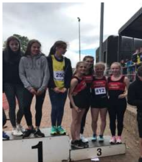
U15 girls relay