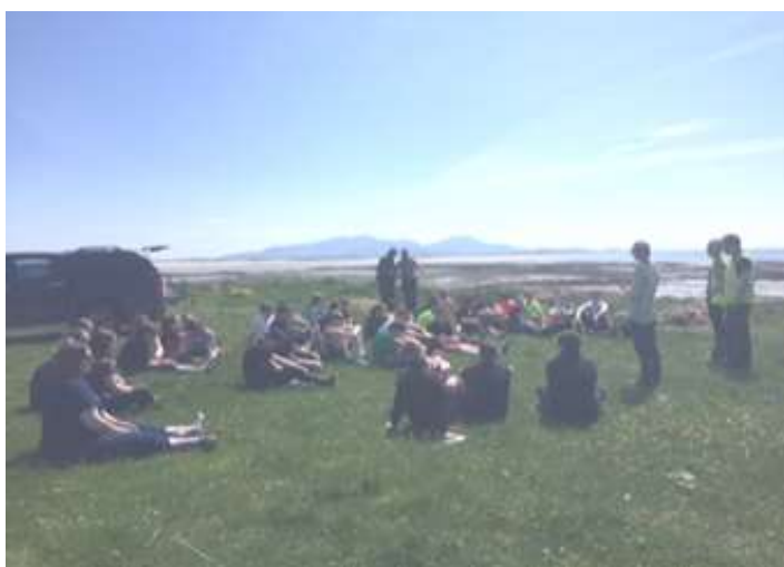
Pictured left and below are S1 and S2 pupils enjoying a trip to the submerged forest.