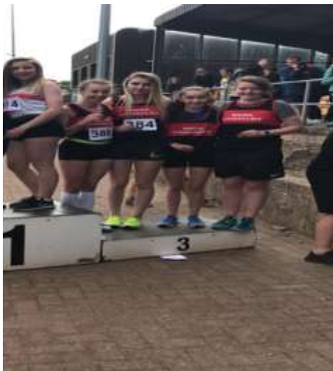
U17 girls relay