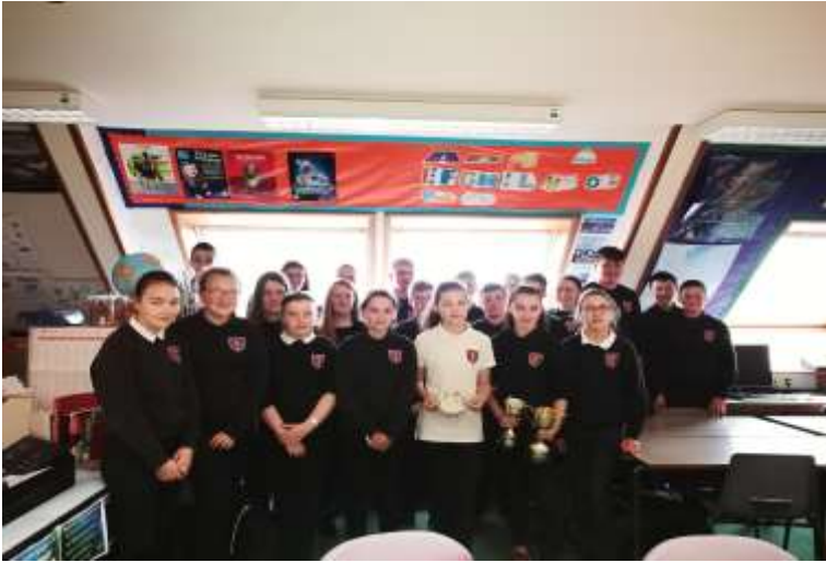
Competitors in the Uibhist Mod

Pictured below are the pupils who took part in Mod Uibhist at Iochdar School on the 25 th May. All pupils are to be commended for their exemplary behaviour and their willingness to take part.