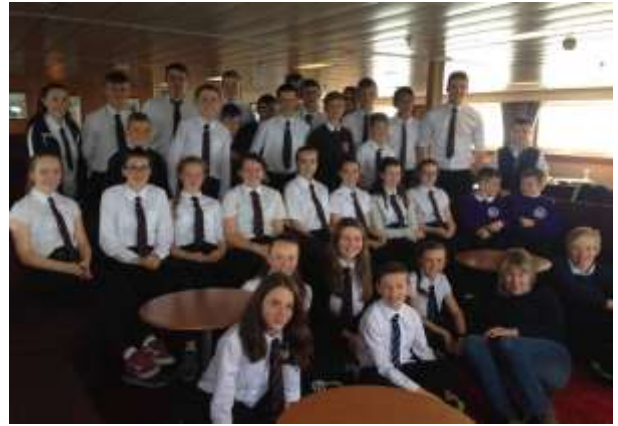
Sgoil Lionacleit and Uist Primary Athletics Team.

A team of 26 pupils travelled to Inverness to compete in the North of Scotland Track and Field Championships. All pupils performed superbly, achieving new Personal Bests, reaching finals and