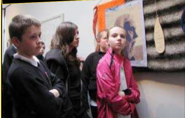
Pictured above: S1 pupils viewing the contemporary works of art on display in the Travelling Gallery.

Once again we were privileged to have a visit from the Travelling Gallery. On Monday 29th and Tuesday 30th September S1-S6 Art and Design pupils were given the opportunity to visit the exhibition displaying the works of five contemporary artists.