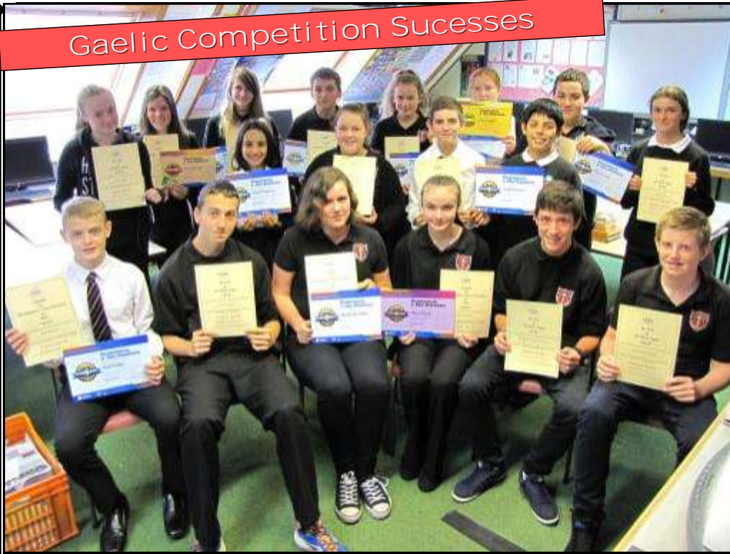
Pictured above: Some of the competition prize winners displaying their well deserved certificates.

CLAS Gaelic Writing Competition Pupils entered a national writing competition organised by CLAS. The following pupils were commended for their entries: Gaelic (Learners)