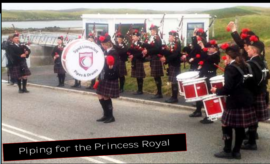
Piping for the Princess Royal