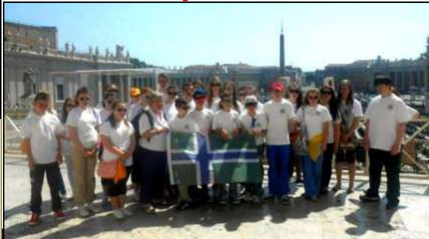
Pictured above: Pupils and staff displaying the Uist flag and enjoying the Italian sunshine at St Peter's Basilica in Rome.